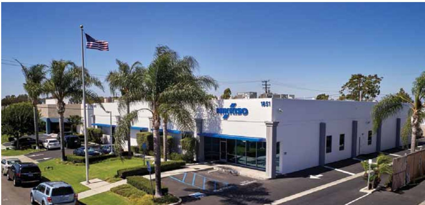
NCS Headquarters, Irvine, CA