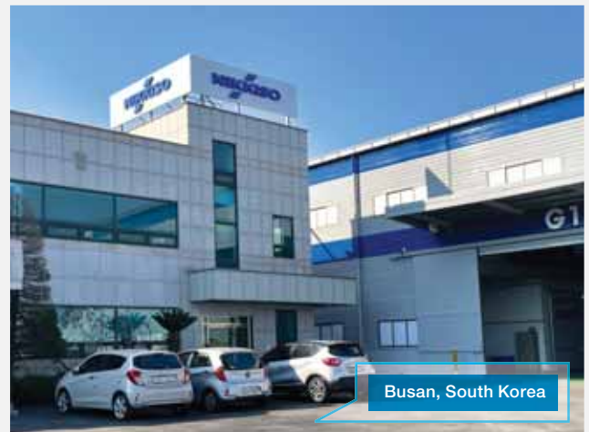
Busan, South Korea